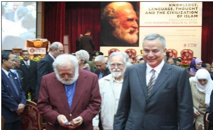
Figure 2: Ungku Aziz walking behind Syed Muhammad Naquib al-Attas and the then Raja Nazrin Shah (now Sultan Nazrin Shah) in 2010 at UTM Kuala Lumpur.

I will accept it with peaceful heart, Praise be to the Almighty, God has given me the opportunity all this while and I would not ask for my life to be prolonged further to do this or that. But if God prolongs my life for another year or ten years, I will accept it and be grateful. 53